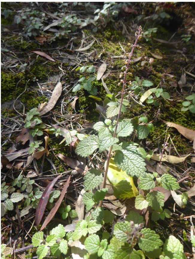
P. parviflorus growing in Katandra

P. parviflorus , commonly known as Cockspur Flower, is a small perennial herbaceous shrub that grows to about 60cm.