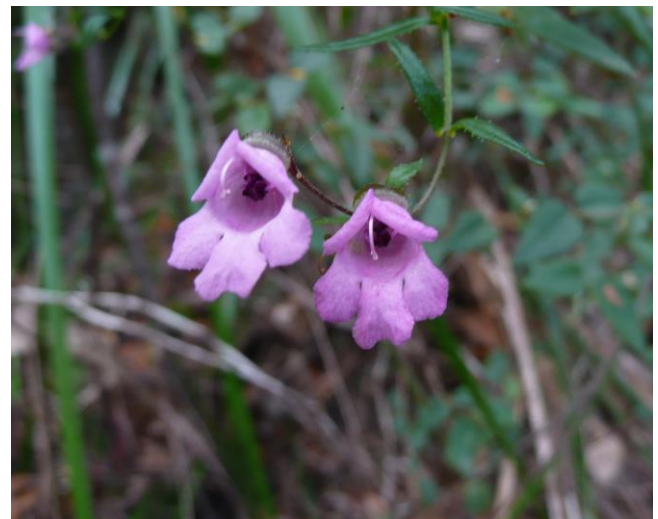
P.denticulata flowering in Katandra

Most species have aromatic leaves due to the presence of volatile-oil producing glands. The flowers are usually strongly irregular, many with a shape described as labiate, having 5 petals varying in size, fused at their base forming a tube.