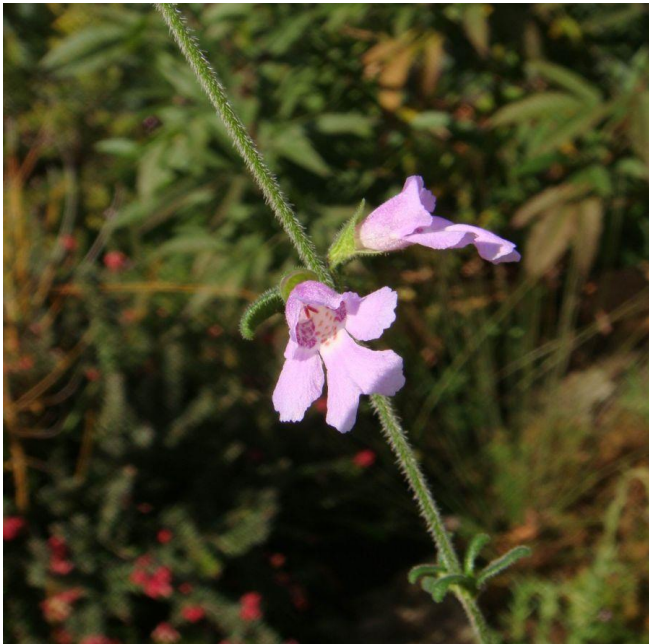
Prostanthera marifolia

Prostanthera marifolia (Seaforth Mintbush) is an erect, openly branched shrub that grows to approximately 30 cm high. Its leaves are green, sparsely to moderately hairy and oval to almost elliptic in shape. It has faintly aromatic foliage and delicate purple to mauve flowers. P. marifolia is closely related to another Lamiaceae species found growing in Katandra, Prostanthera denticulata (Rough Mintbush).