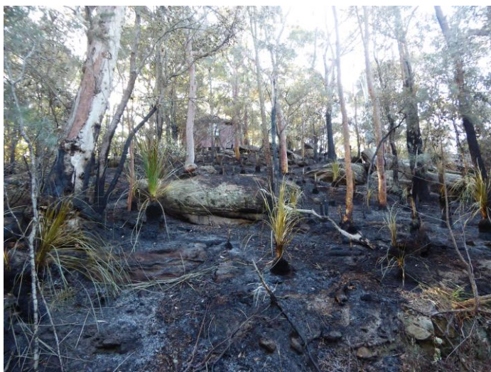
After the fire

The development of Ingleside will not go ahead as previously planned due to unacceptable fire risk. At a meeting of the Ingleside Community Reference Group (ICRG) held in December the following message was presented "The safety of our residents is of paramount importance. Both, DPE and Council planners believe that continuing with the draft plan in its current state would introduce unacceptable risk to the community. We are constantly learning new things about the pattern and behaviour of fires. The Strategic bushfire assessment is in line with