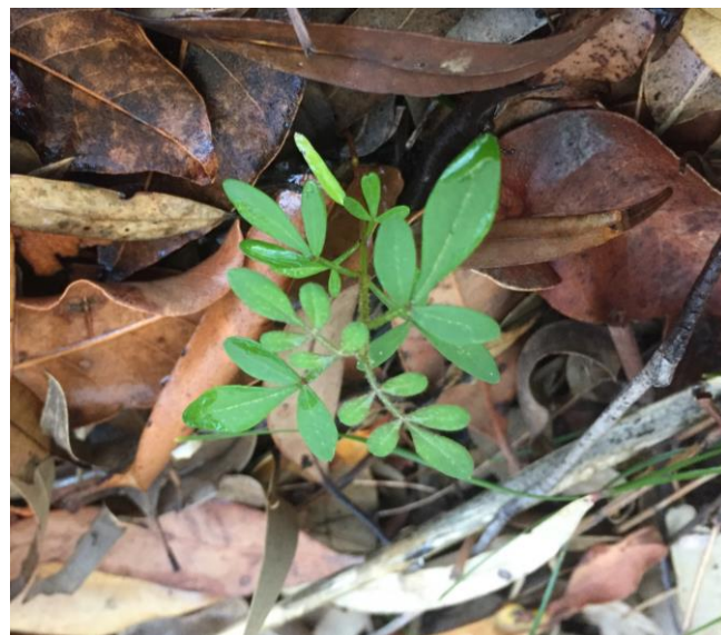
A small seedling of Boronia ledifolia emerging through the leaf litter

The bushland in Katandra is showing good signs of recovery following the controlled environmental burn that was carried out in late July last year. The frequent rainfall earlier this summer has been well received with an abundance of small seedlings springing up throughout the area and the Xanthorrhoea grass trees flourishing.