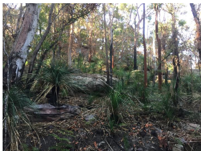
Six months on