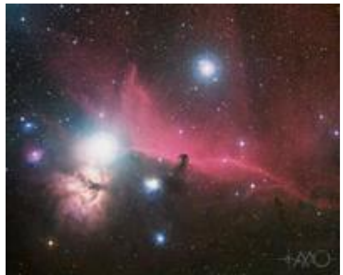
One of David Malin's images showing the Horsehead Nebula in the constellation of Orion.

Congratulations to David for this well-deserved recognition of his wonderful and distinguished career.