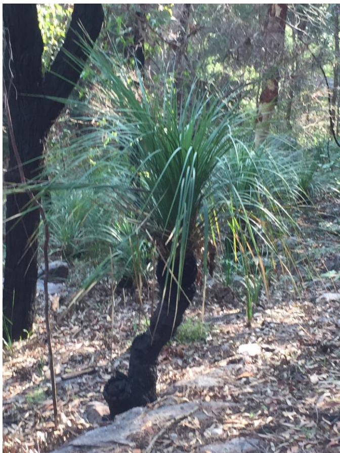
The beautiful contrast of green leaves against the fire blackened trunk of a Xanthorrhoea arborea

The bushland in Katandra is showing good signs of recovery following the controlled environmental burn that was carried out in late July last year. The frequent rainfall earlier this summer has been well received with an abundance of small seedlings springing up throughout the area and the Xanthorrhoea grass trees flourishing.