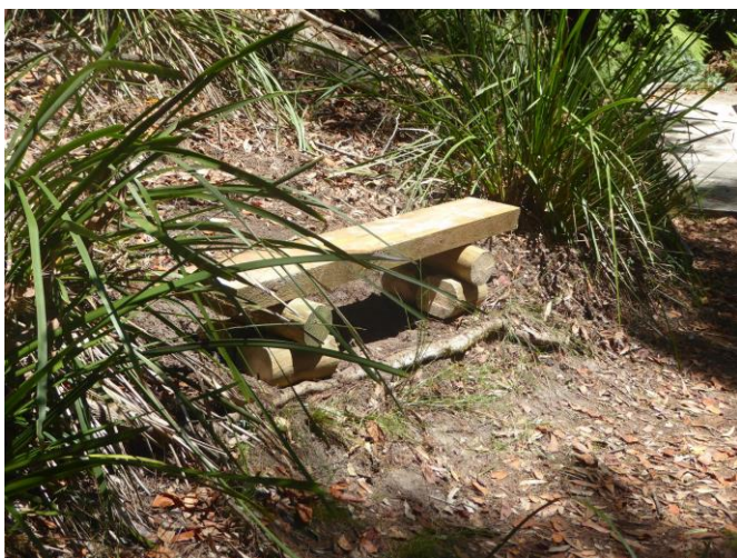
A student team preparing to begin carrying the materials down the track (top right), seat construction (lower right) and the finished product (above)

The boys volunteered their time to help with any labour-intensive projects required in the Sanctuary. They first learned about Katandra from one of their teachers who, after regularly driving past the Katandra sign on Mona Vale Road, looked up the Katandra website on the internet.