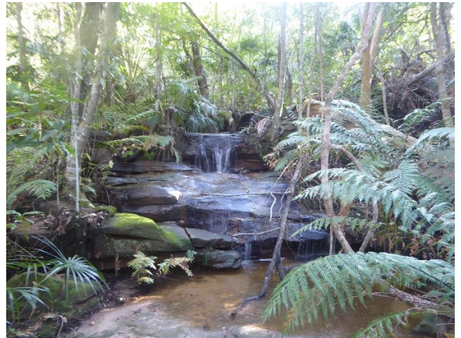
Washpool NP (left), Katandra Creek (above)

Washpool and Gibraltar Range National Parks, in northern NSW between Glen Innes and Grafton, contain some areas of Gondwana Rainforest. These rainforests are so-named because fossil records indicate that when Australia was joined with other continents as part of Gondwana, it was covered by rainforests containing the same kinds of species that are living there today. In 1986 the importance of these rainforests was recognised by World Heritage listing – a chain of fifty remnant “rainforest islands” stretching from SE Qld to Barrington Tops in NSW. Other areas of Gondwana Rainforest also occur in Tasmania.