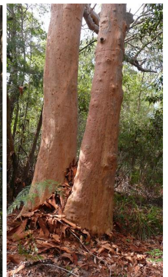
Sydney Red Gum

Sydney Blue Gum and Sydney Red Gum are quite different. Both are mainly smooth barked but the Blue gums are very tall and straight trunked while