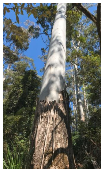
Sydney Blue Gum