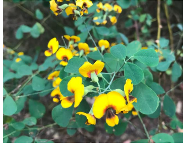
Pea plants from the Faboideae subfamily of Fabaceae growing in the bushland understory of Katandra (left) and Washpool National Park (right)

the Red Gum has a wonderfully gnarled appearance. The similar common names of these trees however, provides a wonderful linking between these two different woodlands. Then to complete the experience we watched a lyrebird scratching away at the leaf litter beside the walking track, similar to many lyrebird encounters in Katandra.