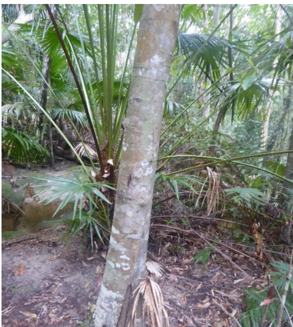
The mottled trunk of a Coachwood

tree-ferns and mottled trunks of Coachwood trees ( Ceratopetalum apetalum ) had a remarkable similarity to Katandra Creek, also lined with tree ferns and Coachwood. This, despite the difference in rock types, Gibraltar Range being made primarily of granite while Katandra is sandstone. (Washpool NP claims to have the largest forest of Coachwood in the world). Away from the creeks in Washpool NP, the woodlands on the hillsides are dominated by tall Sydney Blue Gum ( Eucalyptus saligna ) with an understory of yellow flowering plants of the pea family ( Fabaceae ). In Katandra away from the creeks, the woodlands are dominated by large Sydney Red Gum ( Angophora costata ) with an understory of yellow flowering Graceful Bushpea ( Pultenaea flexilis ) and Native Holly Pea ( Oxylobium ilicifolium ) and Heathy Parrot Pea ( Dillwynia retorta ).