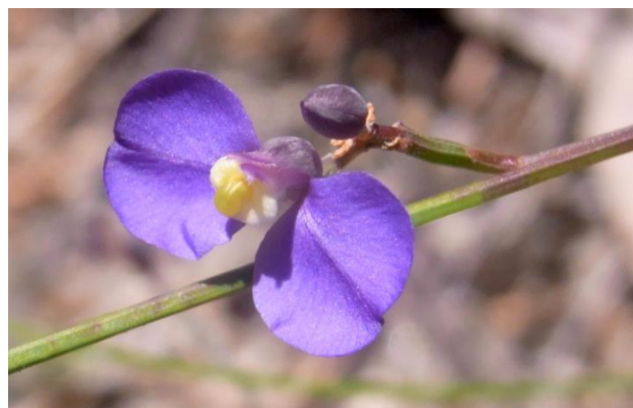
Comesperma sphaerocarpum

Endemic to New South Wales, Comesperma sphaerocarpum is also found along the tablelands and coast in sandy soils. Commonly known as Purple Broom Milkwort , Leafless Milkwort or Fairies' Wings , it is an inconspicuous plant unless in flower.