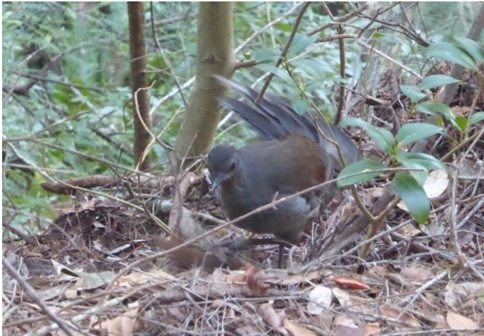
The lyrebird scratching around with her tail kinked to her right.

During the winter months a female lyrebird was seen on many occasions feeding near one of the creeks in the Sanctuary. While a nest was not located, the female was sporting a tail with an obvious kink to one side – a strong sign that she was brooding in a nest. A chick will usually leave the nest sometime in spring.