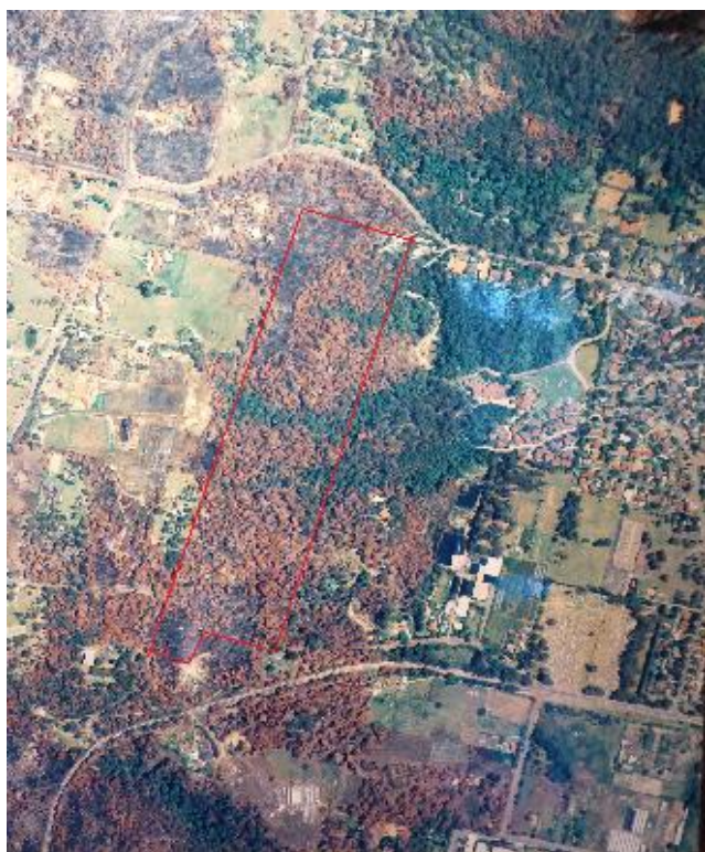
An aerial view of Katandra after the January 1994 fire. The green areas show the line of the creeks which did not burn.

It has now been almost 25 years since the 1994 fire, so some areas of the bushland are well overdue for a fire. In the past “natural” fires have been frequent enough to not require intentional burns to be put in place within the Sanctuary. However, these days, with more surrounding land being cleared for development, more fire breaks being put in place and more backburning operations occurring, natural fires are much less likely to occur. It is quite possible that the fire frequency in Katandra will no longer ever be “natural”.