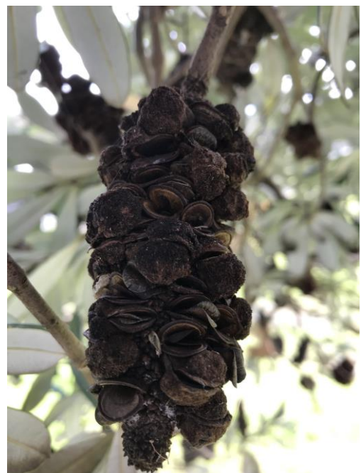
An old withered "Banksia Man" with some follicles opened having released the seeds stored inside