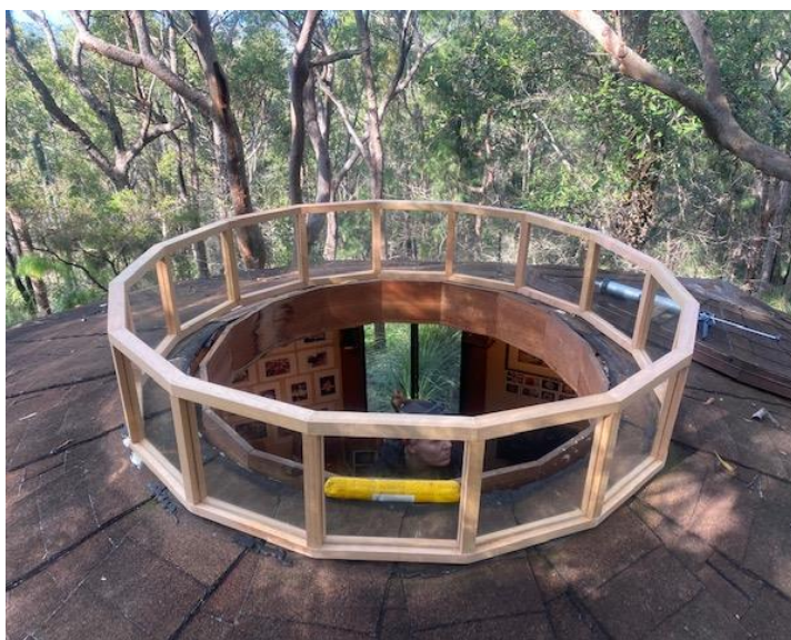
The Katandra yurt under repair

The yurt which functions as Katandra's visitor centre has had some repairs to the roof cupola at the top. This building is almost 40 years old, having been built in the early 1980's. It miraculously survived the bushfire in 1994 despite the trees all around and hanging over it being burnt. With these repairs and the recent replacement of the entrance veranda it should easily last for another 40 years.