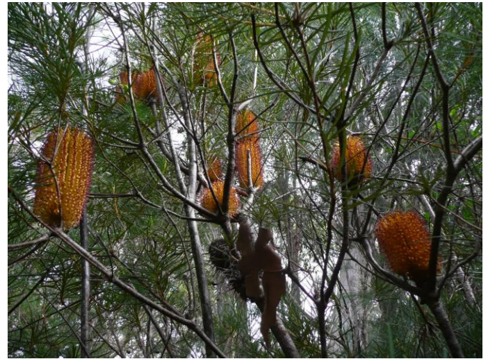
Banksia spinulosa flowering in Katandra

After fertilisation the ovary develops into a woody fruit called a follicle. Despite the large number of flowers on each spike, only a few of them develop fruit. Each follicle has two valves which protect two small winged seeds. These follicles remain stored unopened on the tree, attached to the woody interior of the flower spike long after the flowers die off. Only when completely dried out will the follicles open to release the seeds eg if the tree dies or they are stimulated by fire.